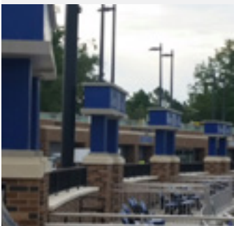
DAS Stadium Boxes